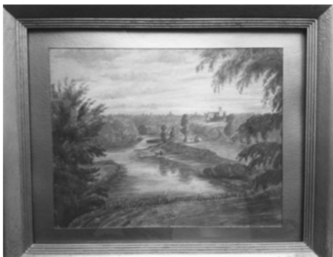
St. George's Anglican Church collection